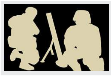
Insurgent Mortar Pair